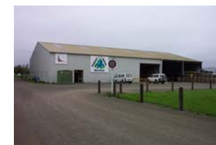
Wellington Street, Opotiki