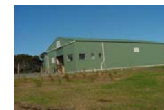
Orete Forest Road, Waihau Bay