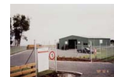
Copenhagen Rd, Te Kaha