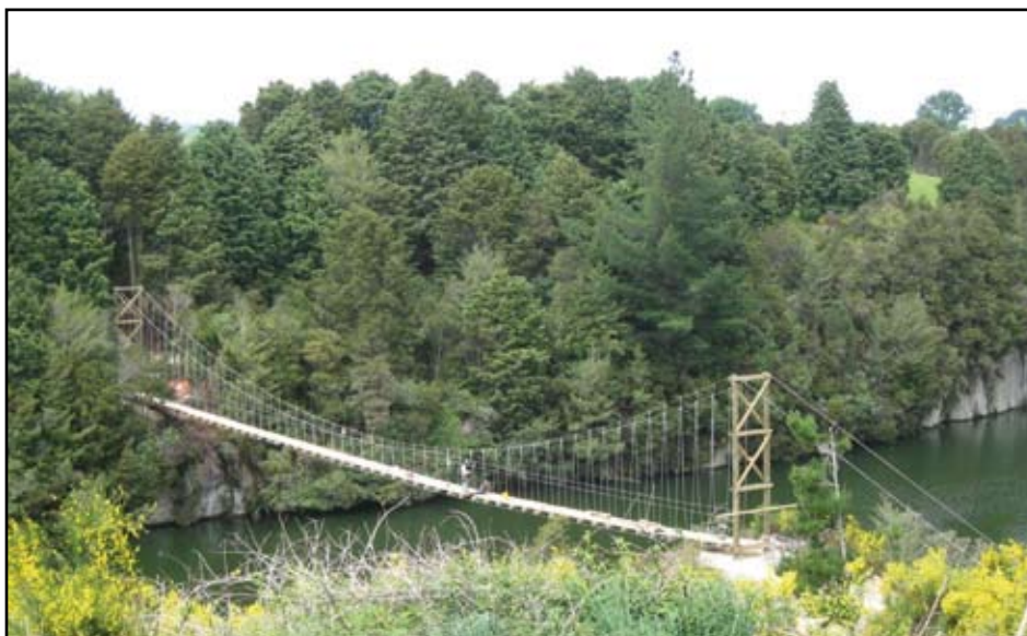
The Waikato Trail bridge design will be replicated for the Otara River bridge. Construction begins in March.

The cycle / pedestrian bridge will be situated at Memorial Park and will connect St John Street to Snell Road. Construction is scheduled to begin in March and it will not be long before Ōpōtiki residents have access to the beach and those who embark on the trails have an attention-grabbing start or the end of what is bound to be a fantastic holiday experience.