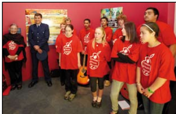
Ōpōtiki Youth travelled to Wellington for the opening of their exhibition at Te Papa.