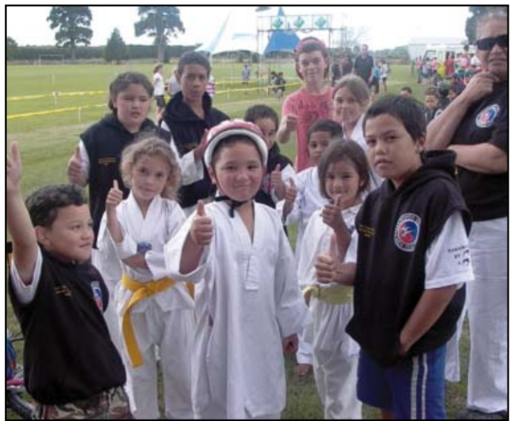
Ōpōtiki Tae Kwon Do Club give the Christmas duathlon the thumbs up.