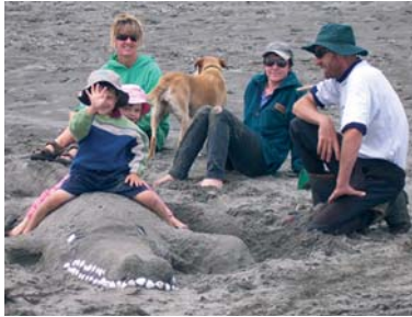
The Waiotahi Drifts Beach Sculpting Competition attracted a happy crowd as did the Waiotahi Country Market, the inter camping ground tug o' war competition, Stag and Boar Fishing Competition and many other events and activities that were held in Opotiki over the summer holiday period.