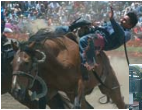
The Opotiki Rodeo attracted a record crowd of around 5,000 people.

Proceeds from the event go to the Eastern Bay Hunt Club, Opotiki Lions Club and Project Hope. Following the success of this year's event the Rodeo committee will be considering the additional investment they will need to make to meet capacity next year.