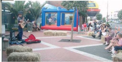
There was music and dancing in the street on the last day of 2006.

Proceeds from the event go to the Eastern Bay Hunt Club, Opotiki Lions Club and Project Hope. Following the success of this year's event the Rodeo committee will be considering the additional investment they will need to make to meet capacity next year.