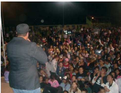
A crowd estimated to be between 3,000 and 3,500 enjoyed Opotiki's Christmas in the Park and a cool looking Santa brought special guest New Zealand Idol Matt Saunooa.