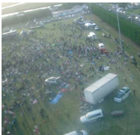
Thousands of people enjoyed Opotiki's Christmas in the Park