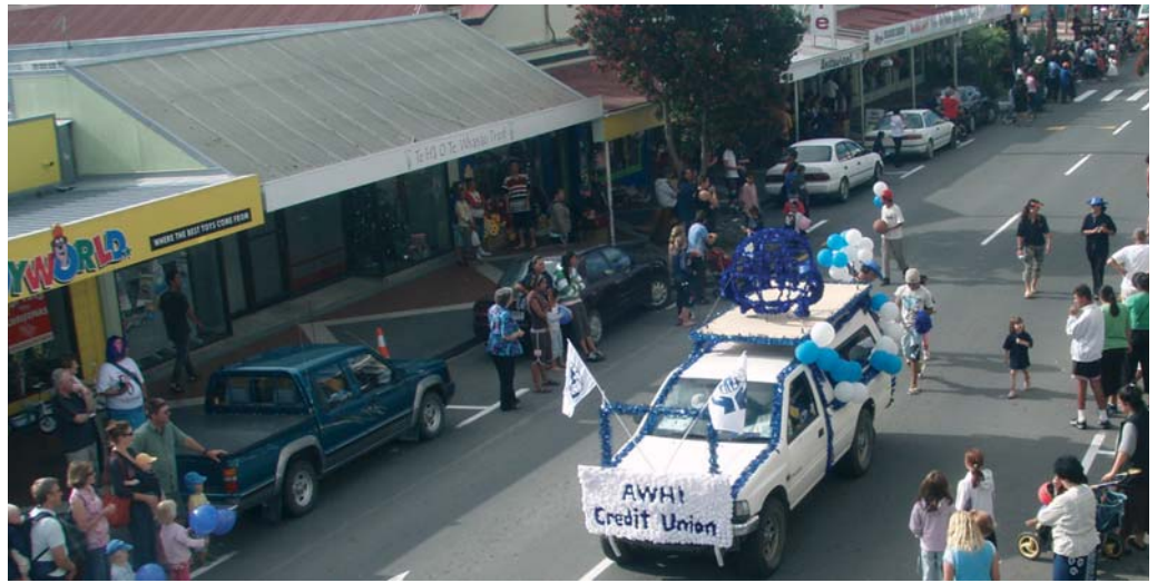
Delighted spectators lined Opotiki's main street to admire more than 40 floats and entries in the 2006 Opotiki Christmas Parade.