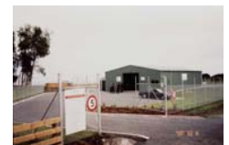
Copenhagen Rd, Te Kaha