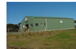
Orete Forest Road, Waibau Bay