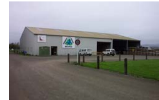
Wellington Street, Opotiki